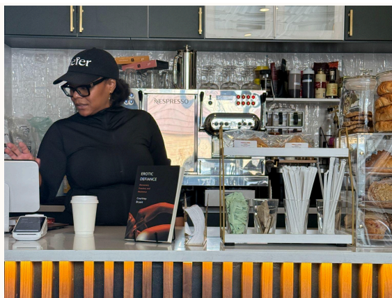
Nefer Bookcafé 694 E. 241st St, Bronx https://www.neferbookcafe.com/ @neferbookcafe